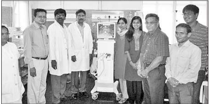
పీడియాట్రిక్ విభాగానికి వెంటిలేటర్ను అందజేస్తున్న పూర్వ విద్యార్థులు