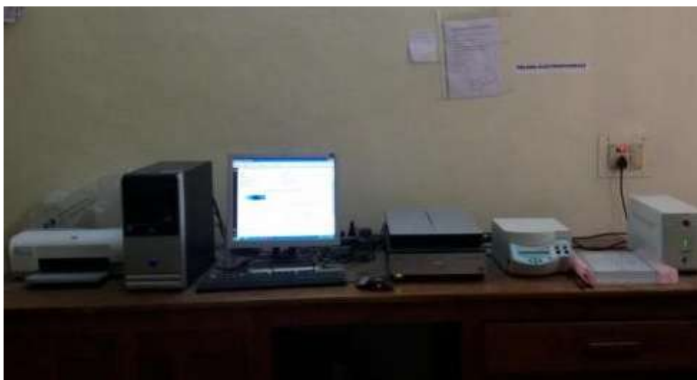
Hb Electrophoresis Instrument set up at Department of BioChemistry, Gandhi Medical College and Hospital

To enhance the range of diagnostics available at the inhouse BioChemistry Lab, support for procurement of Hb Electrophoresis kit was requested. Each kit can perform about 80 tests. The demand from Paediatrics, OBG and General Medicine is expected to be about 25 tests per month. Therefore each kit will support the demand for 3 months. Support was requested for one year. Resources for this area will eventually be mobilised internally at the Hospital. The first kit has been provided to the lab in second week of June, which has helped operationalise the Hb Electrophoresis instrument after a long gap.