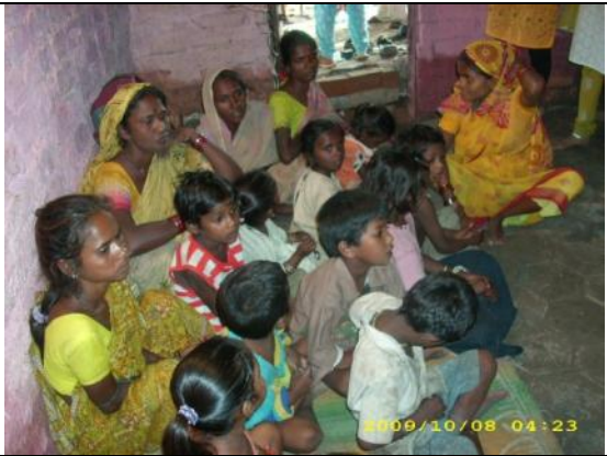
The RagPicking women bring their children to enroll them in the "Classroom Calling" program (Oct-09)