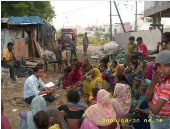
Mobilising the community to participate in Child Education, Financial Inclusion and broader livelihood initiatives(Aug-09)