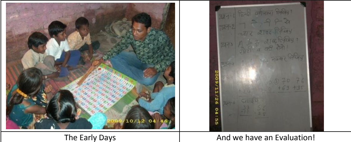
The Early Days