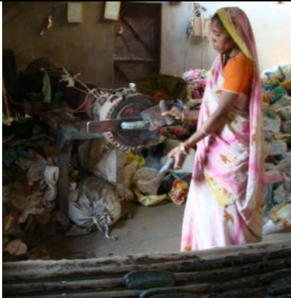
Plastic Recycling Plant Worker