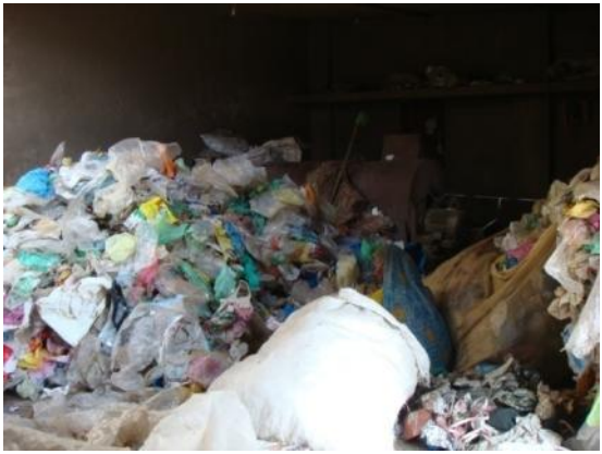
Heaps of Rubbish? Think again!