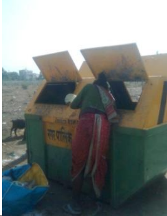
A Rag Picker at work in Indore: reducing the waste going to the land fill