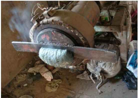
The Output – a Raw Material for Agri Infrastructure